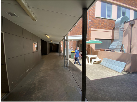
Fig 4. Existing similar Exterior additional canopies to be provided Back Of House (BOH)