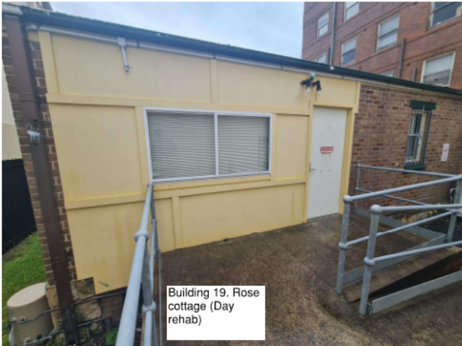
Building 19. Rose cottage (Day rehab)