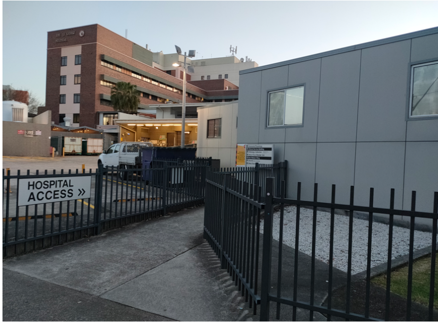
Fig 1. Pelvic Floor Building to be demolished for external works and new access path

External civil and landscape works are to be developed near the north eastern corner of the site off Belgrave street and to the east of the Burt Nielsen Wing & south of the Hydrotherapy pool. These are to be undertaken after the demolition of the Pelvic floor demountable & Sleep Lab demountable. This will upgrade the existing connection from Belgrave street to the Clinical Services Building and to Burt Nielsen. In addition there will be respite areas for staff and visitors to use within a newly landscaped environment.