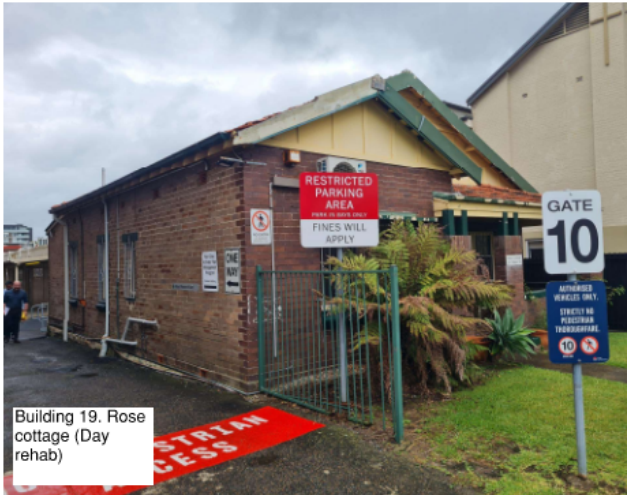
Building 19. Rose cottage (Day rehab)