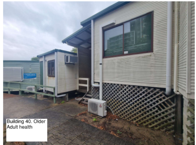
Building 40. Older Adult health