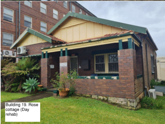
Building 19. Rose cottage (Day rehab)