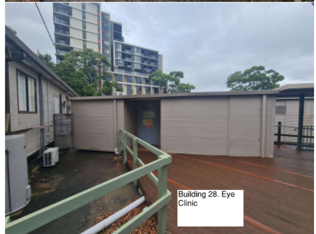
Building 28. Eye Clinic