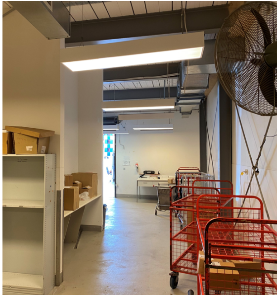
Fig 3. Loading Dock receiving Back Of House (BOH)

The addition of canopy elements over the external pathways connecting the receiving dock and stores to the existing buildings as well as and minor refurbishment works within the Clinical Services Building are also proposed.